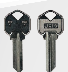
Art. KWI-1 (Like: KS1)