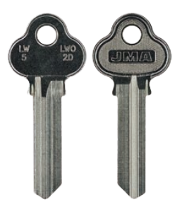
Art. LWO-2D (Like: LW5)