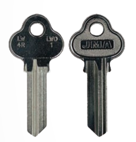
Art. LWO-1 (Like: LW4R)