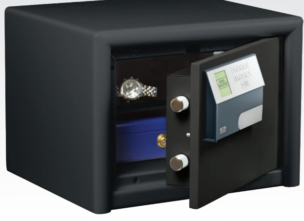
320 x 435 x 380mm